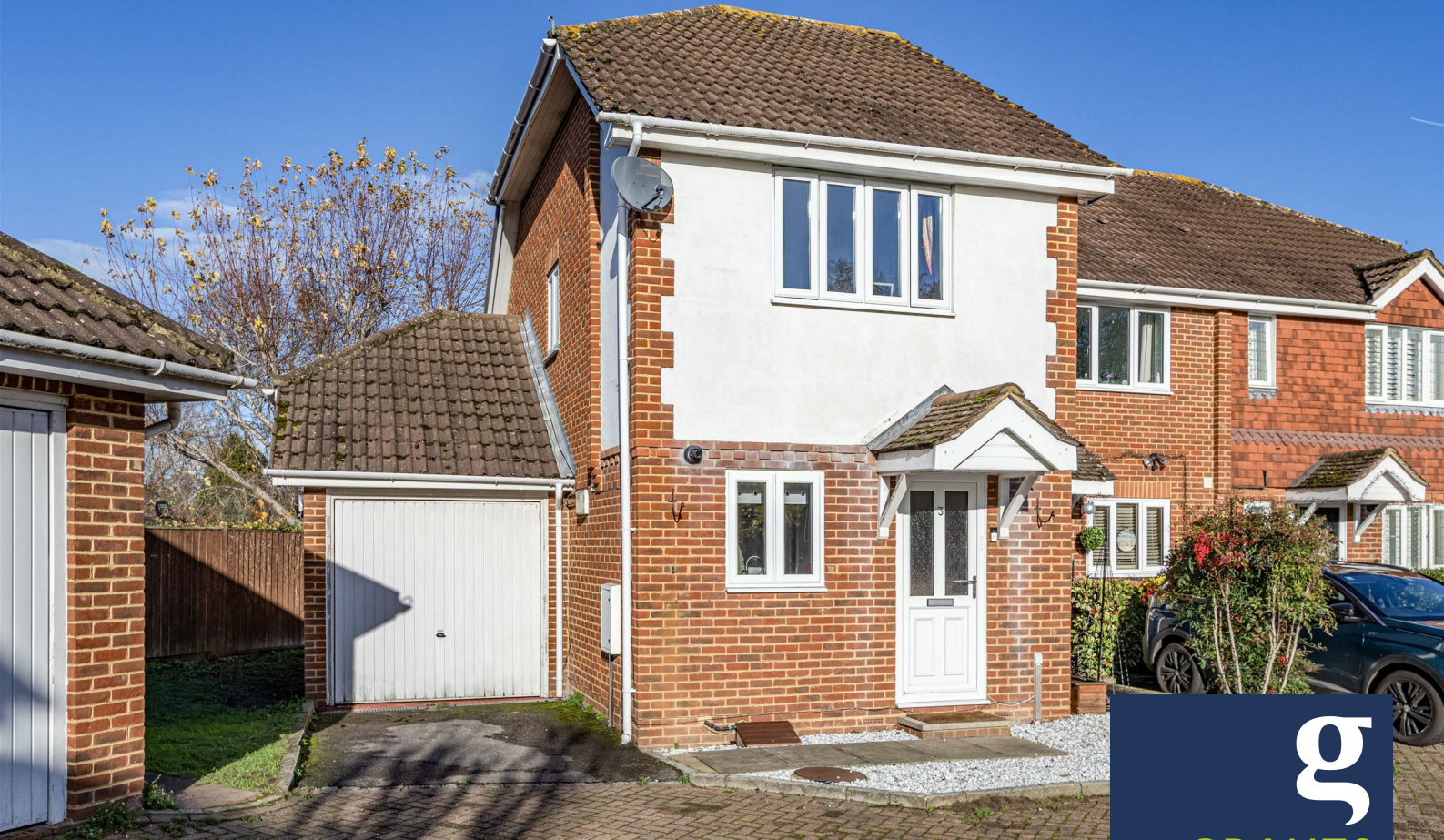
St. Pauls Close, Addlestone, KT15 1RJ